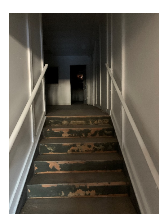
Entry Way leading to the Warehouse